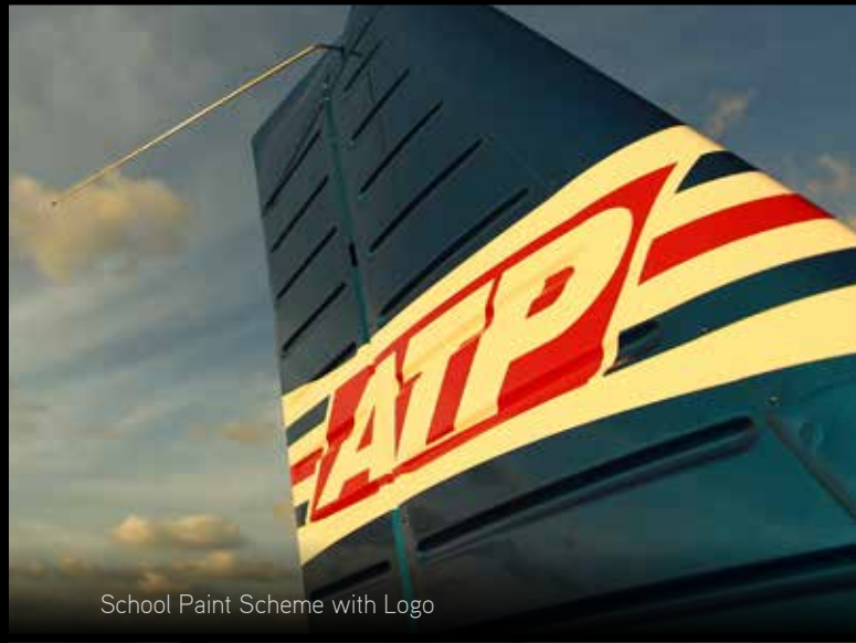
School Paint Scheme with Logo