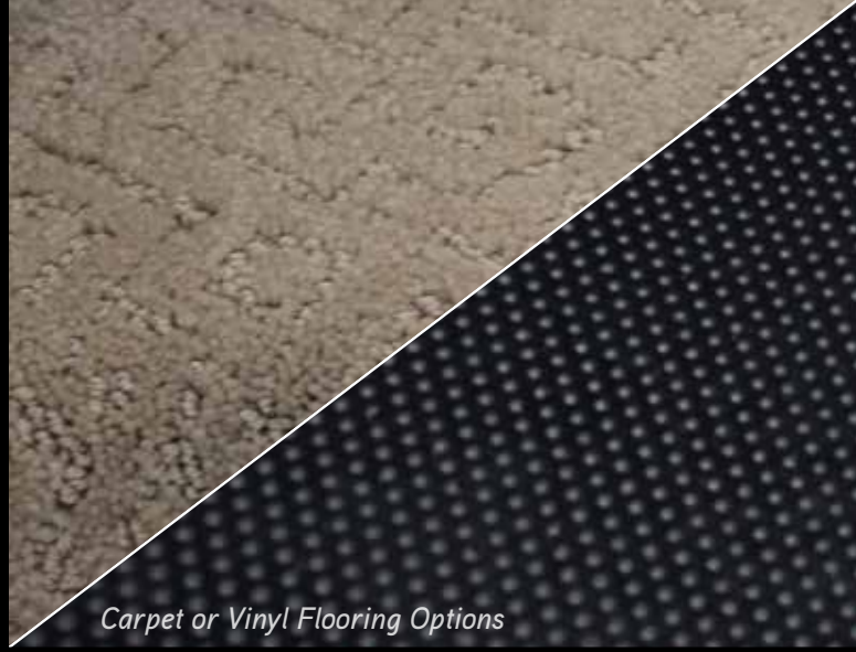
Carpet or Vinyl Flooring Options