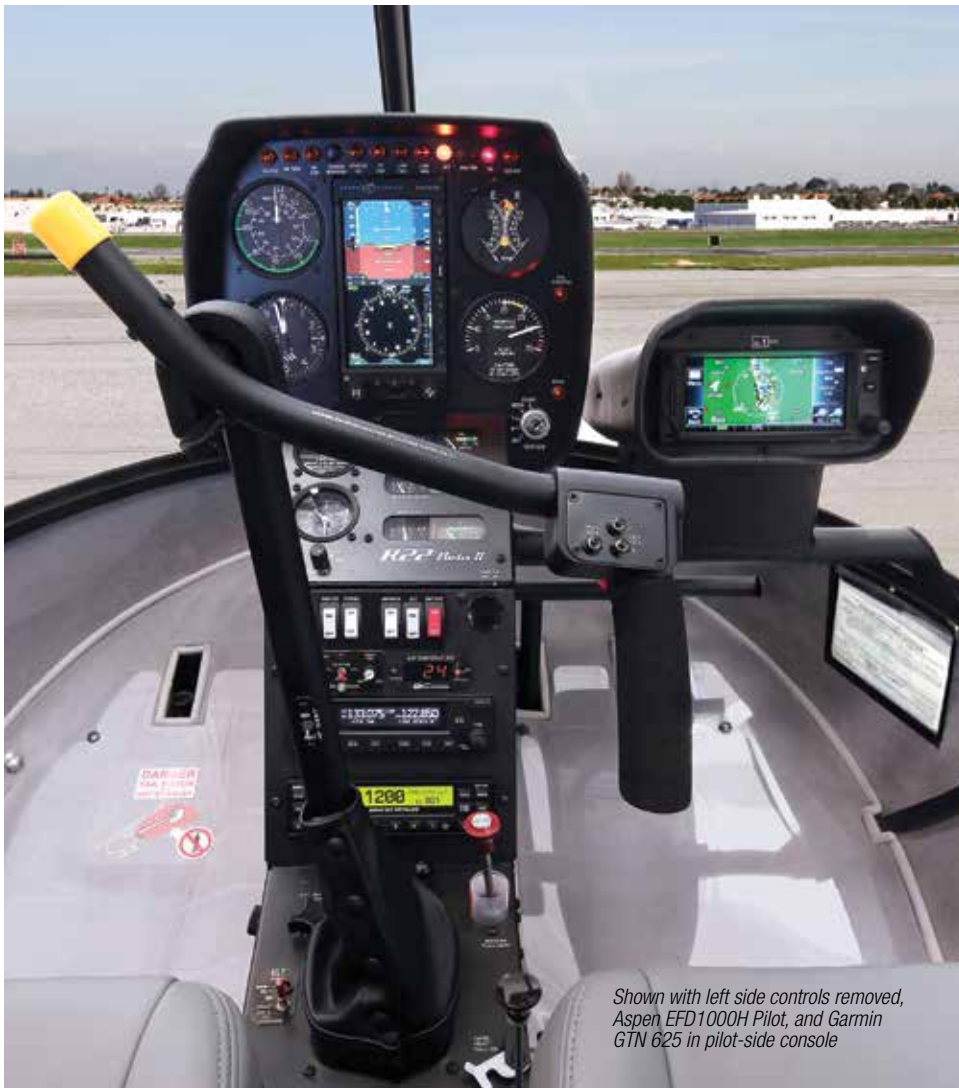
Shown with left side controls removed, Aspen EFD1000H Pilot, and Garmin GTN 625 in pilot-side console