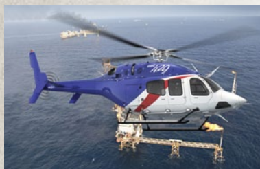
Oil & Gas